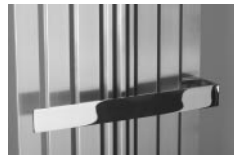
Oris Polished stainless steel Towel Holder