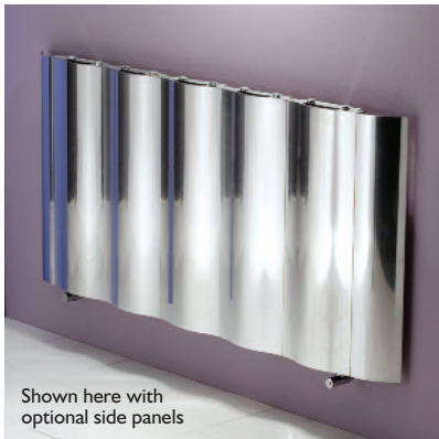
Shown here with optional side panels

The rippling waves of the Motus combine sculptural lines with efficient heat emission. Available in a range of finishes.