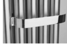
Mistral Polished stainless steel Towel Holder