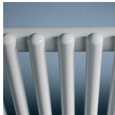
A single tube-on-tube steel radiator which comes in traditional white or anthracite.